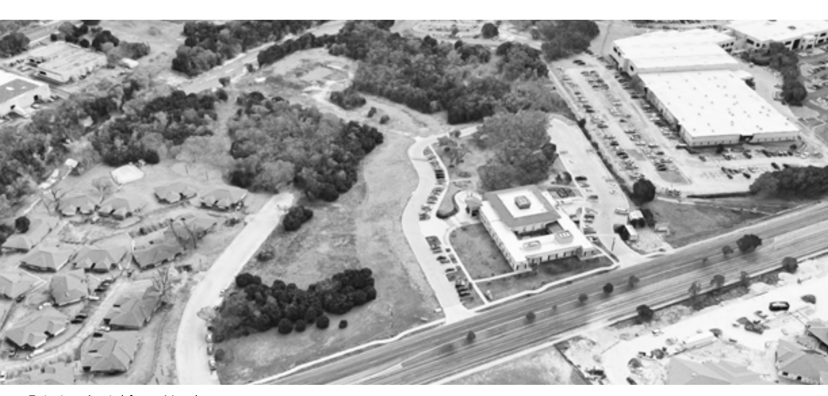
Existing Aerial from Northwest