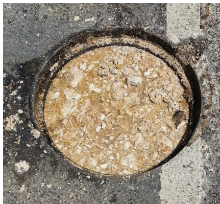
A city manhole choked by grease which passed through a poorly maintained grease trap.