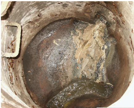
Grease flowing into the sanitary sewer from a food service establishment service line.

Grease found in the city sewer system can be traced back to the source and the costs of repairs and clean up can be passed on to the violator.