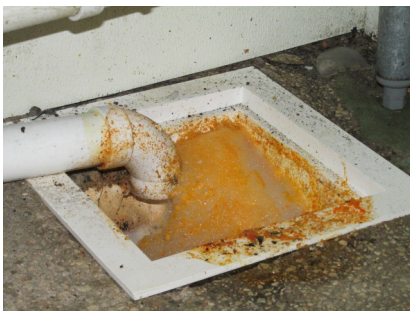
Excessive grease entering the floor drain from a dishwashing sink. Using best management practices in your kitchen can help to prevent overloading your grease trap.