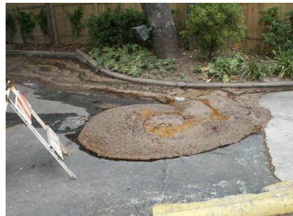
An overflow from a grease trap in the parking lot of a food service establishment.