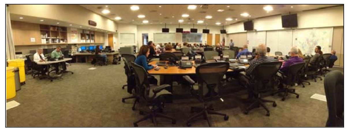
Figure 1. CWPP internal stakeholder meeting.

County employees and officials, and representatives from pertinent non-governmental organizations were invited to these work group sessions.