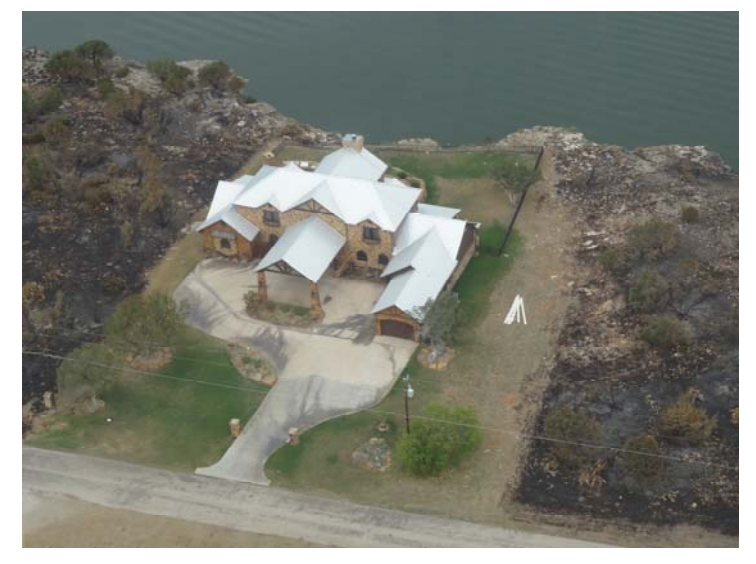
Figure 3. HIZ results after 2011 Lake Possum Kingdom fire.

The basic forms of structural ignition risk from wildfire are radiant heat, spot ignition due to embers, and conductive or direct flame impingement. Radiant ignition risk is based on the intensity of the wildfire causing the structure materials to ignite. Spot ignition risk is related to embers from the wildfire blown into another area where they can ignite fine fuels, like tree litter trapped in rain gutters, and subsequently the entire structure. Conductive ignition